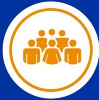
Student-Centered Decision Making