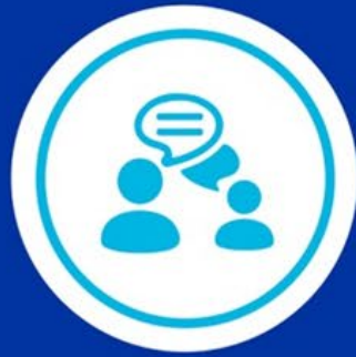
Community Engagement and Influence