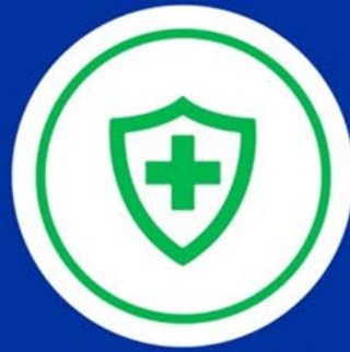
Health and Safety